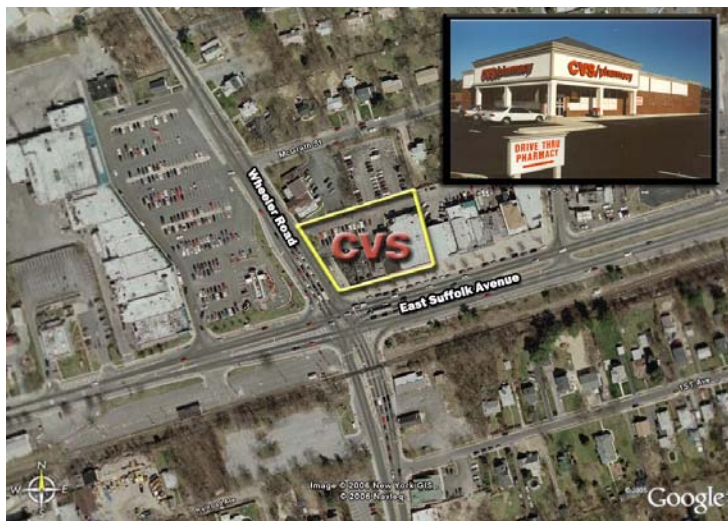
Aerial, Wheeler Rd. and Suffolk Ave., Cenral Islip

Island Associates represented CVS Drugs and the landlord.