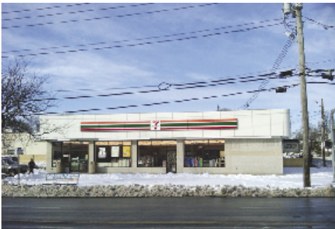
713 Atlantic Avenue - Baldwin, NY