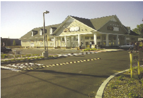
633 Merrick Road - Lynbrook, NY